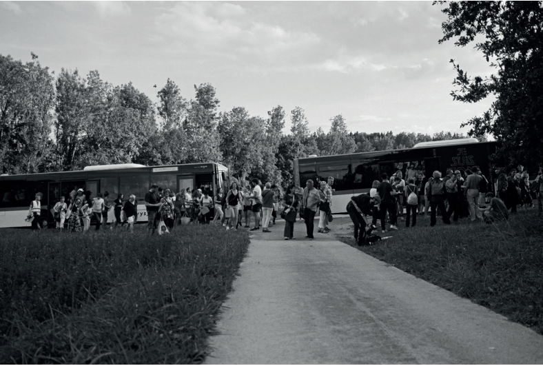
1. Dropping point